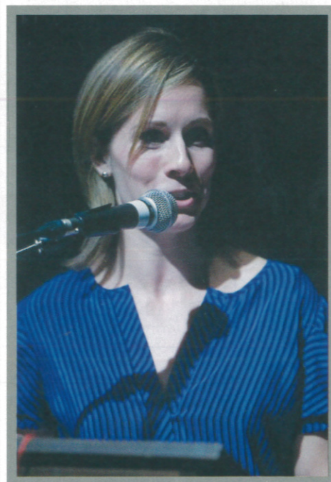
Jennifer Heil, Olympic Medalist addresses the grads of 2010

We were delighted to welcome Jennifer Heil to speak at our convocation on June 4, in Concordia's Oscar Peterson Hall. Ms. Heil is one of Canada's great athletes; she is the 2006 Olympic champion in freestyle mogul skiing and the Silver Olympic Medalist at the 2010 Winter Olympic Games.